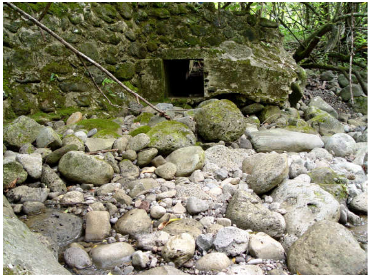
The Historic Kaluanui Māno—Head of the Rice Planters' 'Auwai