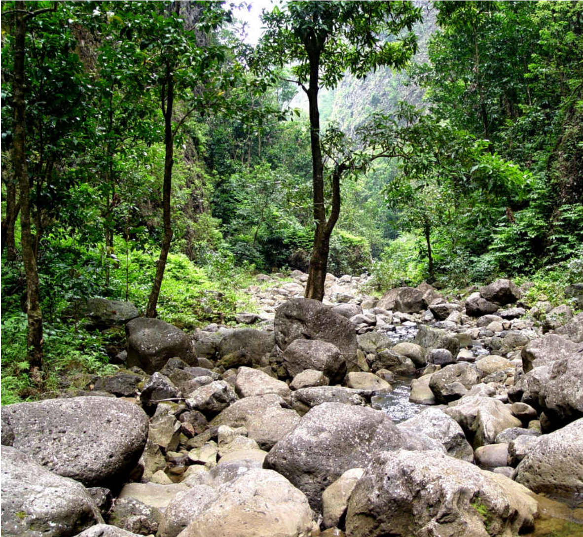
Kaliuwa‘a Stream From Back of Valley Towards the Lowlands (KPA Photo No. S-1338)