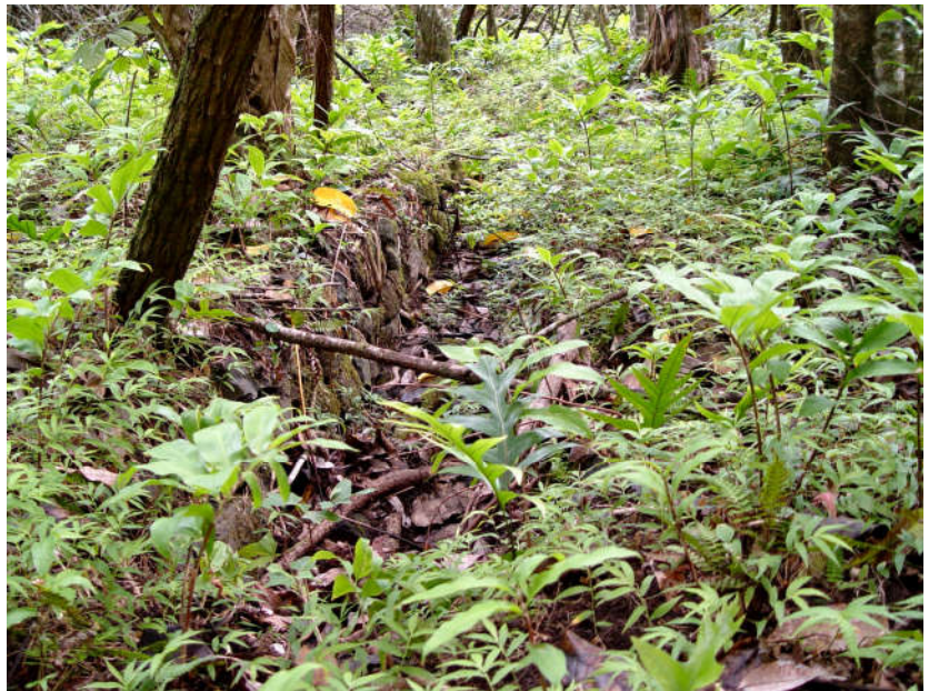
Portion of the Historic 'Auwai from Kaliuwa'a Stream (KPA Photo S-1319)

KM: Do you remember the 'auwai that ran out of the valley? You know how they make māno, a place to catch the water, the dam like, up? Do you remember that? RA: I don't remember. KM: You don't remember. RA: We just followed the trail up, and that's the way we went. KM: Nice though. RA: Yes. KM: By and by when I send you the mo'olelo, I'll send you a photograph of that old māno and where the 'auwai began up Kaliuwa'a stream.